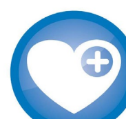
Fit and Well