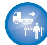
Line of Fire