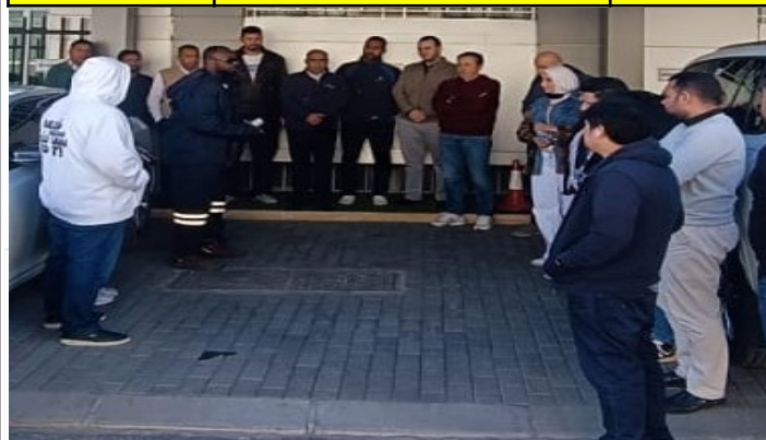
Emergency Evacuation Mock Drill Conducted at Shuwaikh Office