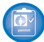
Permit to Work

The Life-Saving Rules provide a framework and guidance for working safely. Life Saving Rules are Important reminders of the top critical hazards that help every employee to: Reduce the possibility of serious injury or death, Understand the potential workplace hazards, Use proper precautions to manage risks, Work together safely and go home healthy etc. Always follow the Life-Saving Rules, for your own safety and for others. It is very important that everyone who works for SPETCO including business partners must know the 10 Life-Saving Rules of SPETCO.